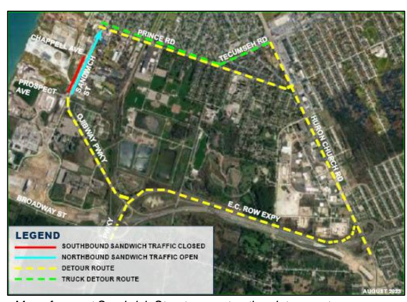
Map of current Sandwich Street reconstruction detour routes.

Traffic information can be found on the project website GordieHoweInternationalBridge.com and on the project social media channels listed below.