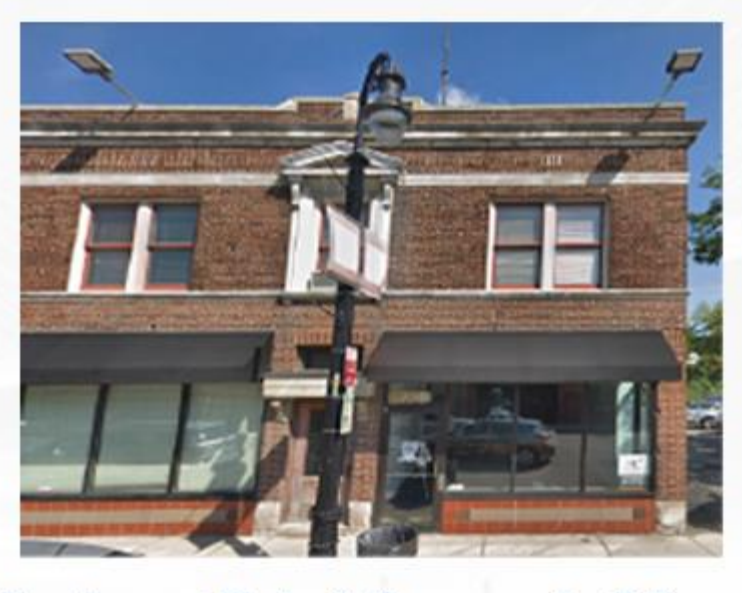
Southwest Detroit Community Office 7744 W Vernor Hwy. Detroit

Community office hours: Tuesdays 10:00 a.m. – 4:00 p.m. Thursdays 10:00 a.m. – 4:00 p.m.