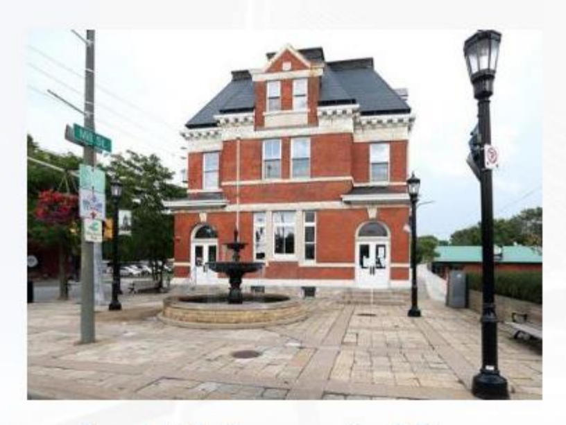
Sandwich Community Office 3201 Sandwich St. Windsor