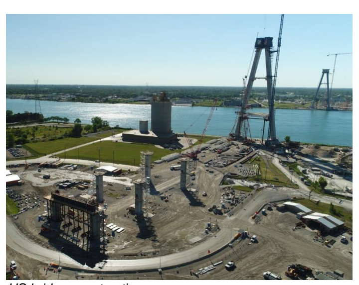
US bridge construction

Construction of the lower pylons or tower legs have joined together – a significant milestone on both sides of the river. The towers will continue to rise as single pylons and reach a total height of 220 metres/722 feet. Each tower is composed of 51 different segments that are being constructed using a jump form climbing system that "jumps" vertically every 15 feet. The jump form systems showcase artwork from local artists from Walpole Island First Nation, Caldwell First Nation and Southwest Detroit.