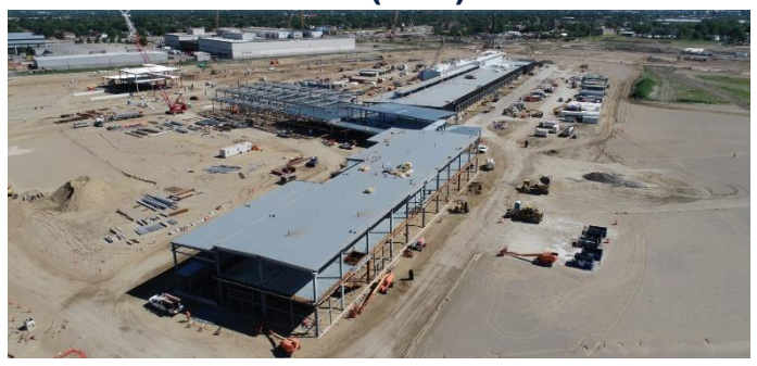
US Port of Entry facility construction

Construction activities are advancing at the US POE as buildings continue to take form.