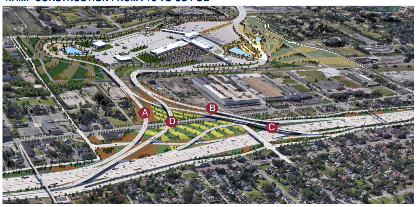
Conceptual rendering showing ramps connecting I-75 to the US POE