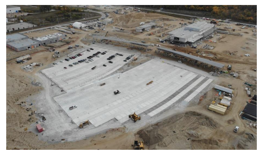
Canadian Port of Entry primary inspection lanes.

Work is underway on all buildings and canopy structures. The POE buildings continue to take shape with some in early construction, with excavation and foundation work underway, while others have progressed further with installation of roofing, building façade, stud and block walls, and interior rough-ins for mechanical, electrical and HVAC systems.