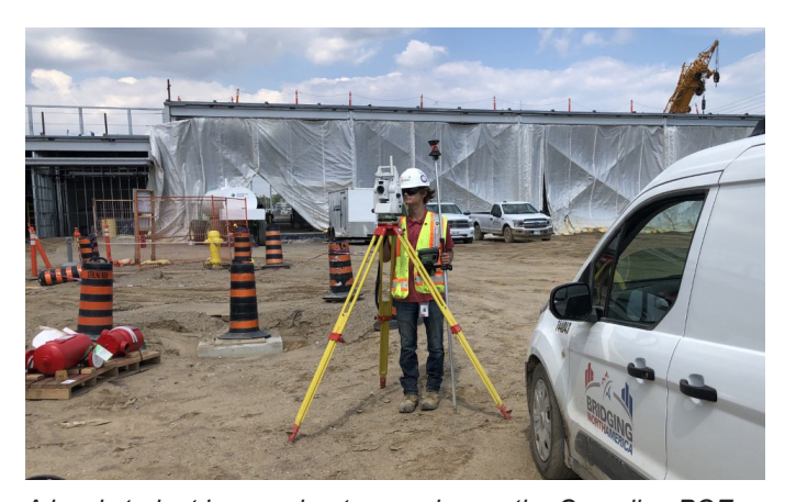
A local student learns about surveying on the Canadian POE.

The project team supports workforce development and training programs through identified delivery partners in Windsor and Detroit. As a result of these programs, local workers have an opportunity to develop skills needed for careers in the construction industry. A graduate of Access For All Apprenticeship Readiness' Cohort 18 was sponsored by BNA as a Carpenter Apprentice and is currently working on the Michigan Interchange. Visit the project website for more information on how to work on the project with participating unions.