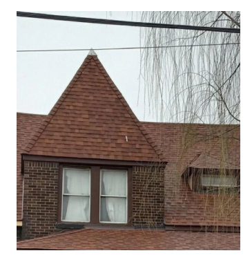
Workers replace the roof of a home in Delray as part of the Delray Home Improvement Program.