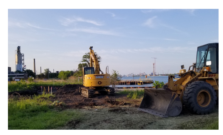
Site grading took place in the summer to prepare for construction of the observation area in River Rouge.

Construction continues on the Bridgeview Point project to create an observation area in River Rouge.