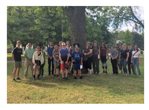
Community members attended ERCA's Tree Identification Walk in August 2022 at Mic Mac Park in Sandwich.