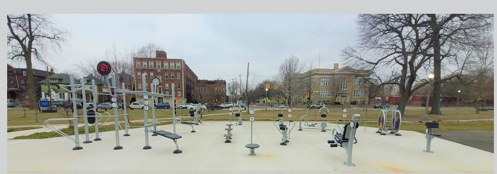
Newly installed fitness equipment in Clark Park, Southwest Detroit.

As part of McKee Park improvements, the City of Windsor has installed a new gazebo and enhanced the existing boardwalk. The improvements, along with other enhancements to park paths, lights and benches, represent the $200,000 initiative.