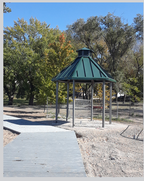
A new gazebo and enhanced boardwalk at McKee Park, Sandwich.