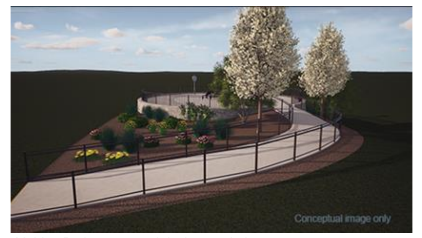
Malden Park conceptual design rendering.

When complete, the observation area will be a landscaped area at the highest elevation in Malden Park enhanced with railings, benches and wayfinding signage, directing viewers' attention to a clear vantage of the Gordie Howe International Bridge.