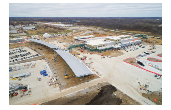
Canadian Port of Entry Flyover Footage

Check out this new flyover drone footage of the Canadian Port of Entry. All 11 buildings are in various stages of construction and paving and grading work has begun.