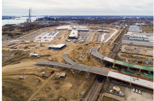
Canadian Port of Entry (left) and the US Port of Entry (right)