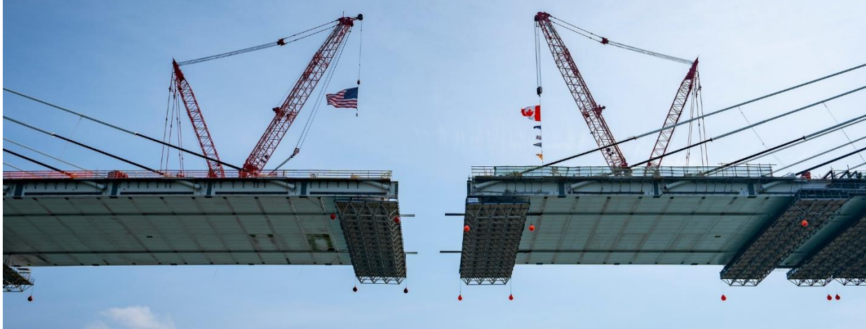
US (left) and Canadian (right) bridge decks close to connecting.