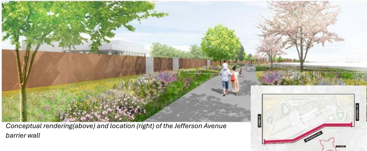
Conceptual rendering(above) and location (right) of the Jefferson Avenue barrier wall

Construction of the Jefferson Avenue barrier wall, an eight-foot security wall along the US Port of Entry (POE), is in progress. When complete, the barrier wall will face Jefferson Avenue and span from Green Street to Campbell Street.