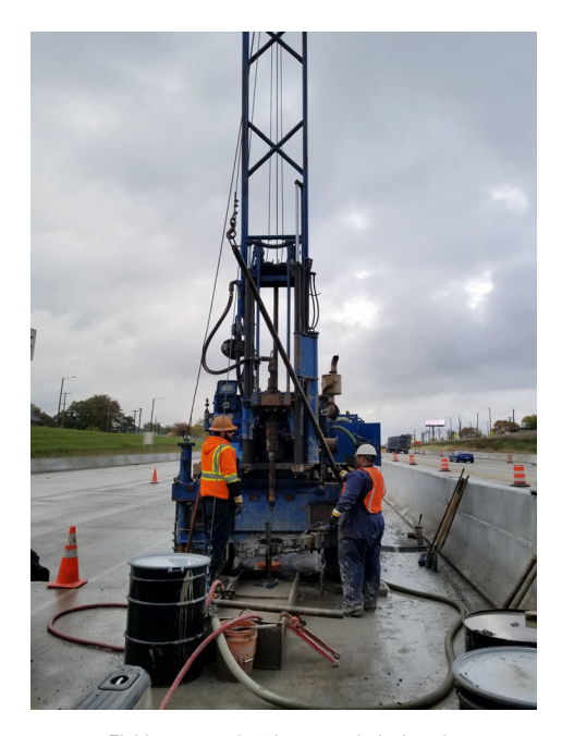
Field crews undertake geotechnical work

In the first part of 2019, motorists travelling near the future site of the US POE should plan a few extra minutes onto their travel as road closures will occur to accommodate Phase 1 work. Closures are set to occur on the cross streets between South Street and Jefferson Avenue and include Schroeder Street, Waterman Street, Rademacher Street, Reid Street, Crawford Street and Livernois Avenue. A signed detour will be in place. The map below shows the closures in more detail.