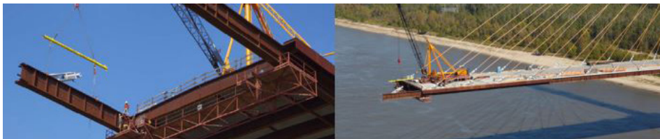
Example of a stick build construction method

The materials and equipment needed for bridge construction will be transported over the back span approach to the main span where work is underway. These activities will occur at the bridge deck level, eliminating the need for any water-borne equipment. Construction on the bridge deck over the river is projected to start in 2023.