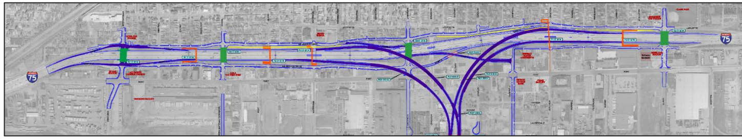
I-75 between Springwells Street and Clark Street. See colours identified below.

One of the project components is the Michigan Interchange connecting to Interstate-75. Approximately three kilometres or 1.8 miles of I-75 between Springwells Street and Clark Street will require modifications to accommodate the ramps connecting to the US Port of Entry (POE). The future project configuration of this area includes the following: