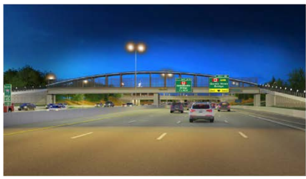
Nighttime view from I-75