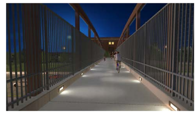
Nighttime view from inside of bridge

The pedestrian bridges will be constructed of pre-cast concrete girders and concrete decks, walls and ramps. The steel arch will have a medium bronze finish and the railings will be manufactured from metal alloy. The bridges will also have overhead LED lighting features. Importantly, the bridges will be compliant with Americans with Disabilities Act (ADA) standards.