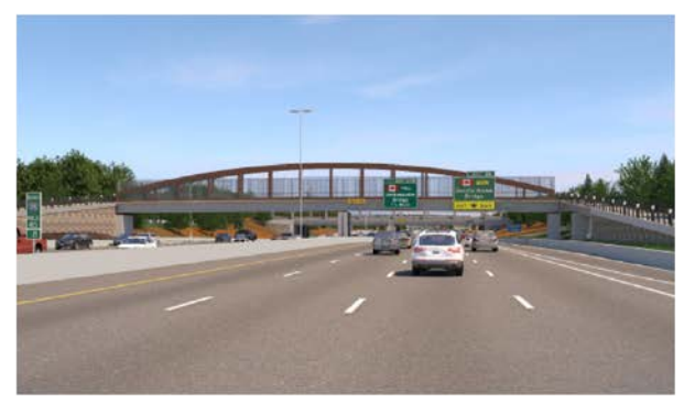
Daytime view from I-75