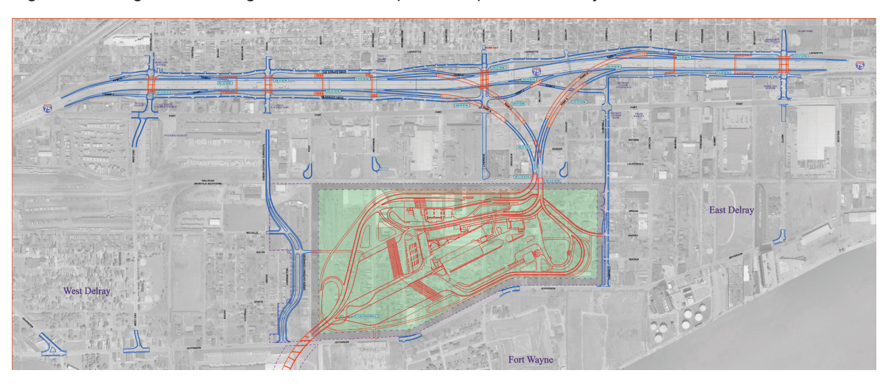
Figure 4: Michigan Interchange work to be completed as part of the Project