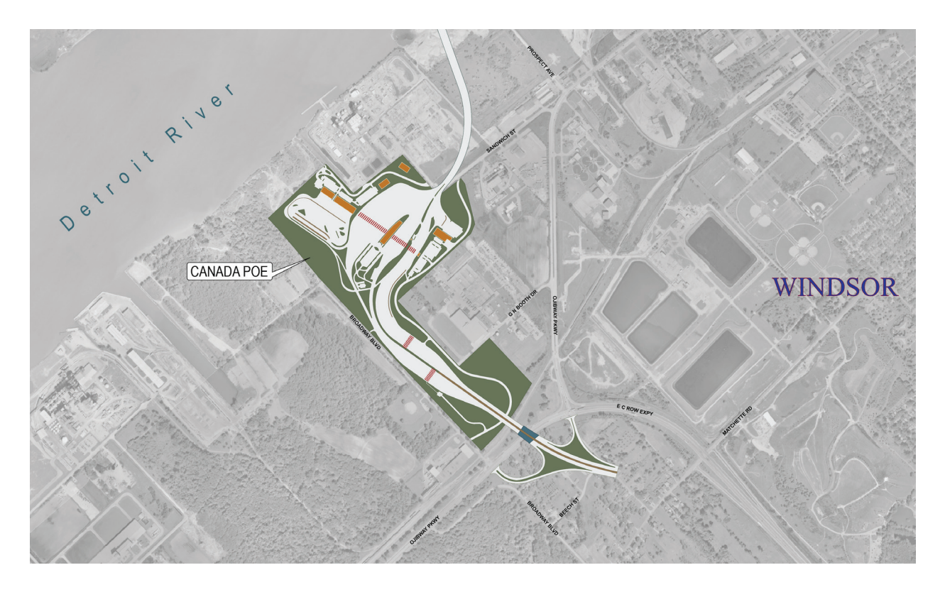
Figure 2: Canadian POE Functional Layout

Note: The optimal layout of the Canadian POE has not been finalized. Final concept, numbers of booths and configuration of facilities may be altered prior to or during the RFP Process.