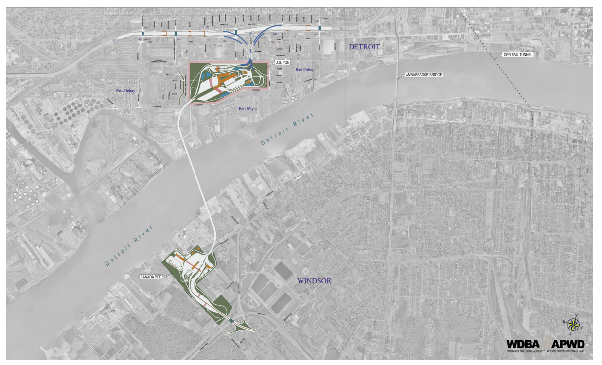
Figure 1: Facility Location

An aerial view of the location of the Facility is shown in Figure 1.