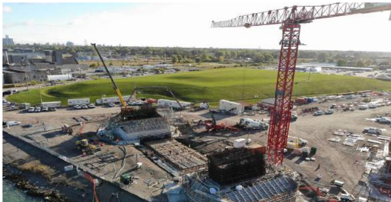
Progress continues on the Canadian bridge site